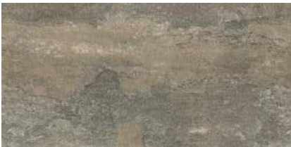
Ocean Slate 2319 LRV 23