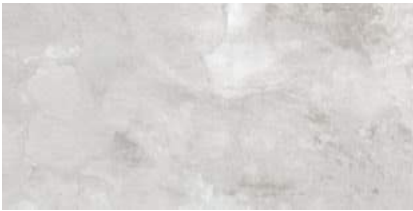
Arctic Slate 2341 LRV 53