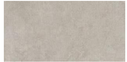
Soho Cement 2347 LRV 50