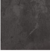
Atlantic Slate 2339 LRV 8