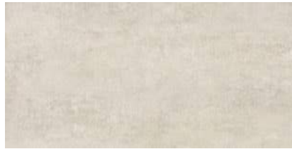
White Metalstone 2332 LRV 57