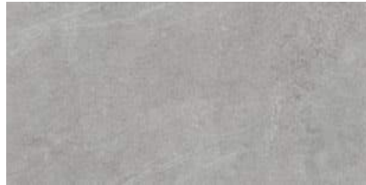
Tribeca Cement 2348 LRV 39