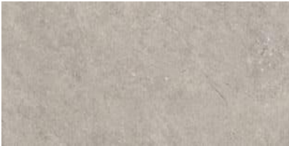
Burnished Concrete 2342 LRV 37