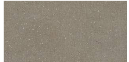
Goldstone Micro Terrazzo 2349 LRV 29